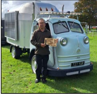
Firstly we picked out this 1952 Tempo Matador. Built in Hamburg, Germany by a company called Vidal and Shon the aircooled engine was supplied by Volkswagen.

We do appreciate all the support that you give this event; it's only a success with your involvement. The range of different vehicles that came along is always a pleasure to see we really appreciate everyone that supports this event, here is our top 3 winners for the show and shine.